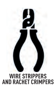
WIRE STRIPPERS AND RATCHET CRIMPERS